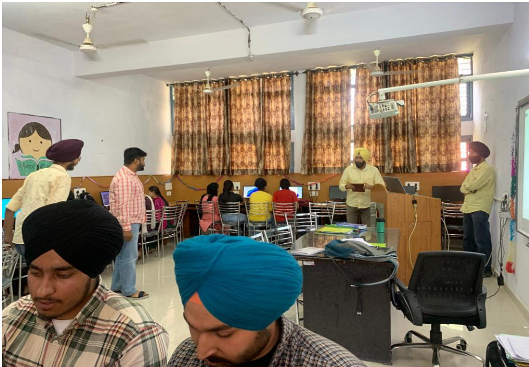
Students undergoing Training of Data Care Management